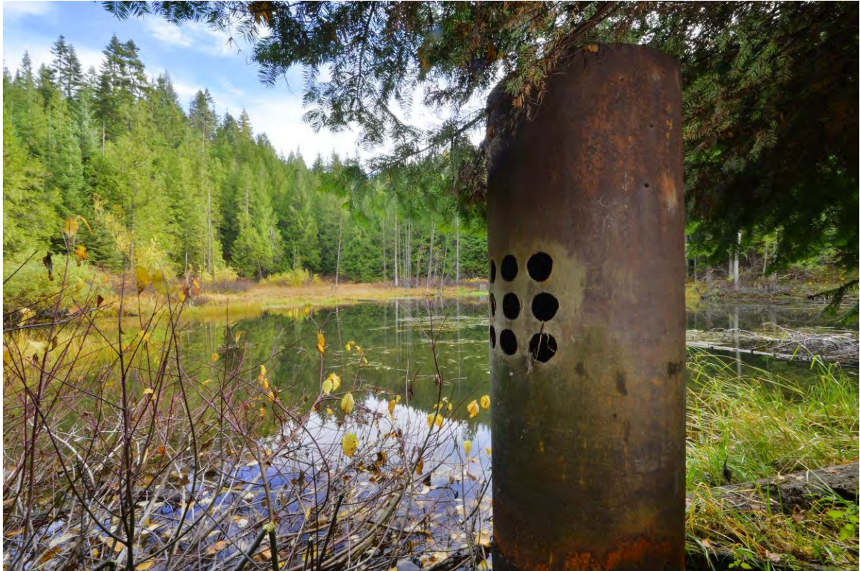
Red Mountain Railway – station pond overflow pipe - 2013