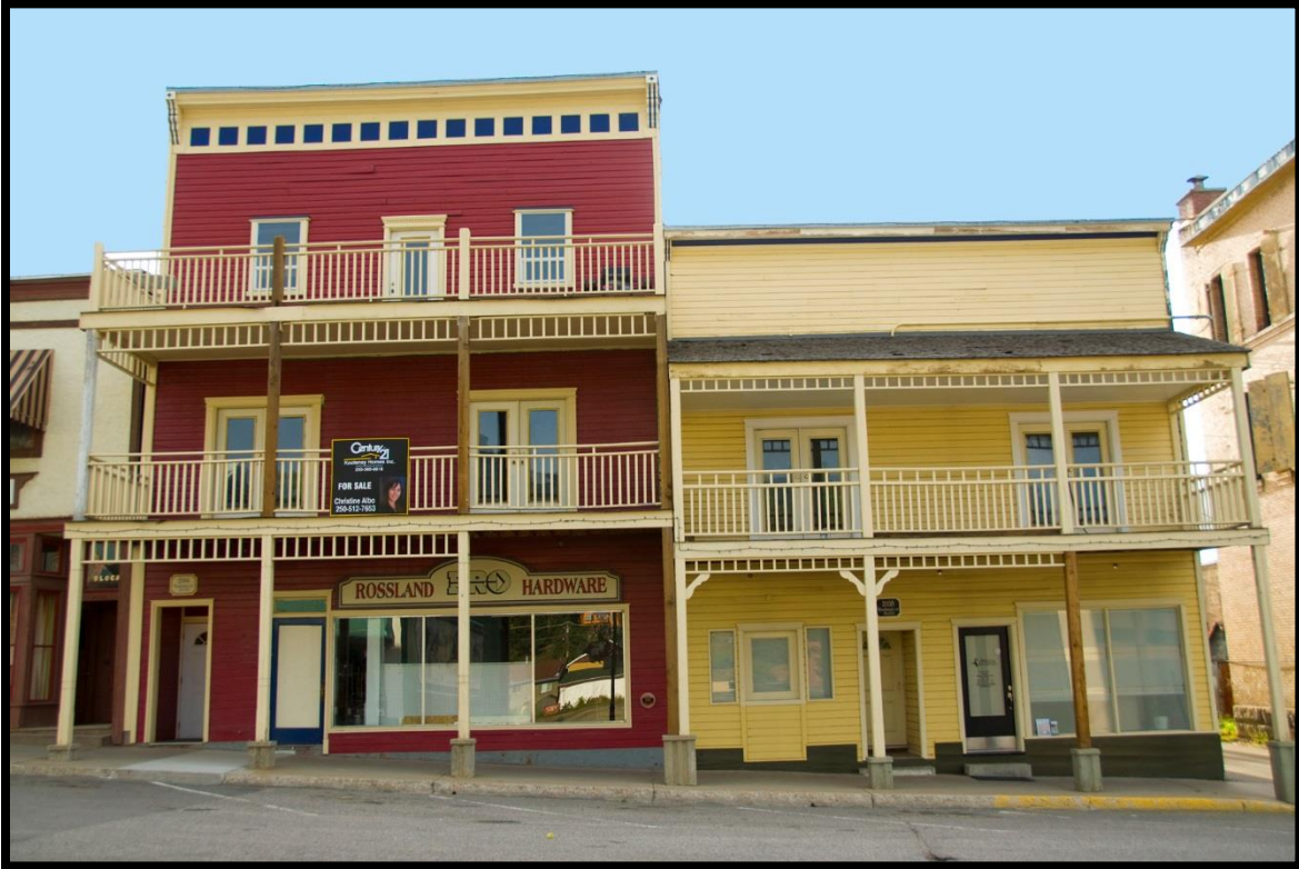
Collins Hotel 2009 (yellow building)