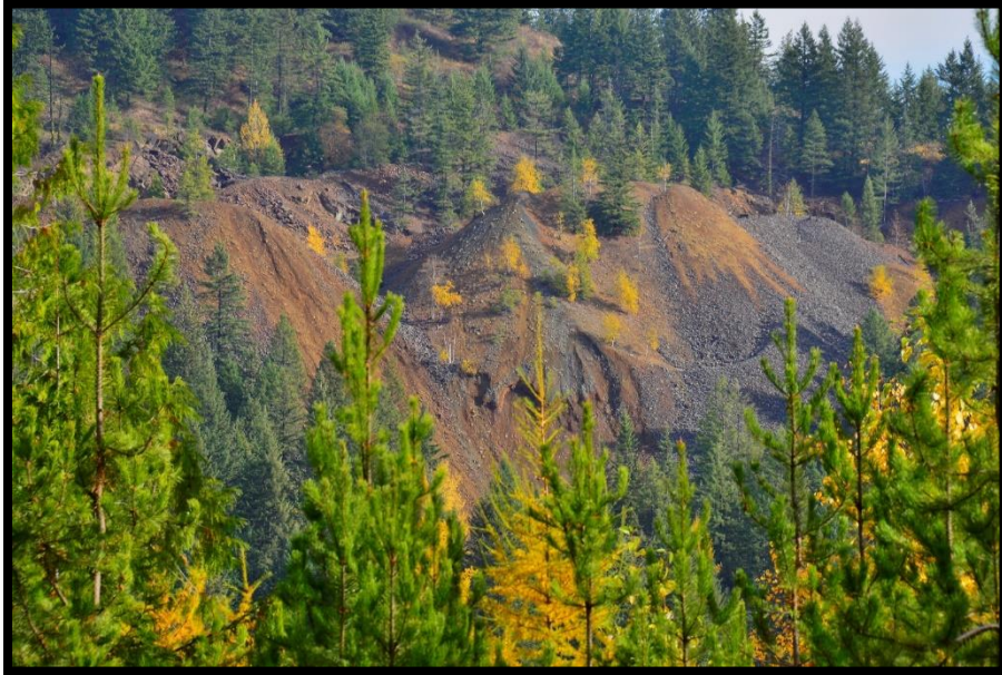
Ore Dumps on south slopes of Red Mountain 2014