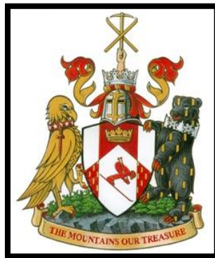
City of Rossland Corporate Seal