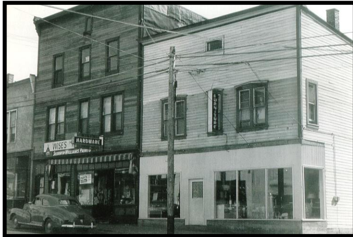
Hoffman House c. 1944