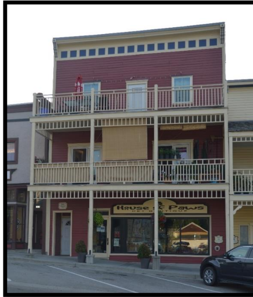
Hoffman House 2021