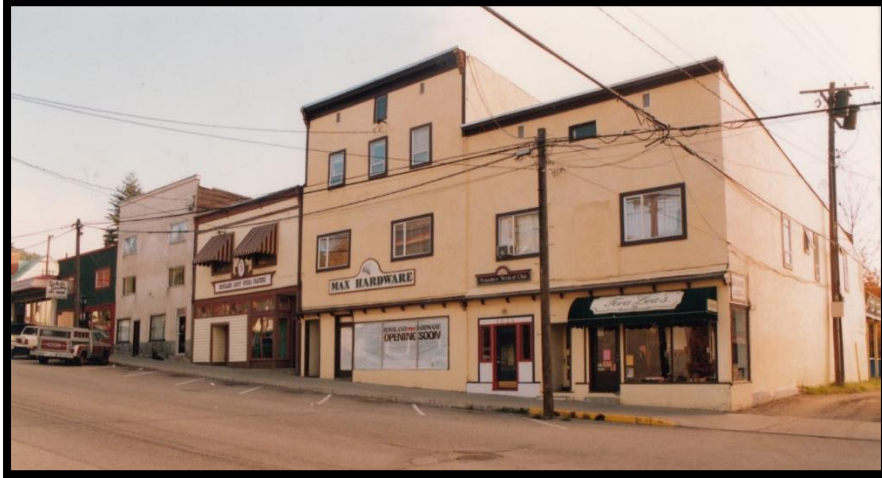
Hoffman House and Collins Hotel - 1987

remained in this building until 2005 when it moved to the Hunter Brother building on Columbia Ave. At some point between 1997 and 2005, the building façade was returned to its original appearance.