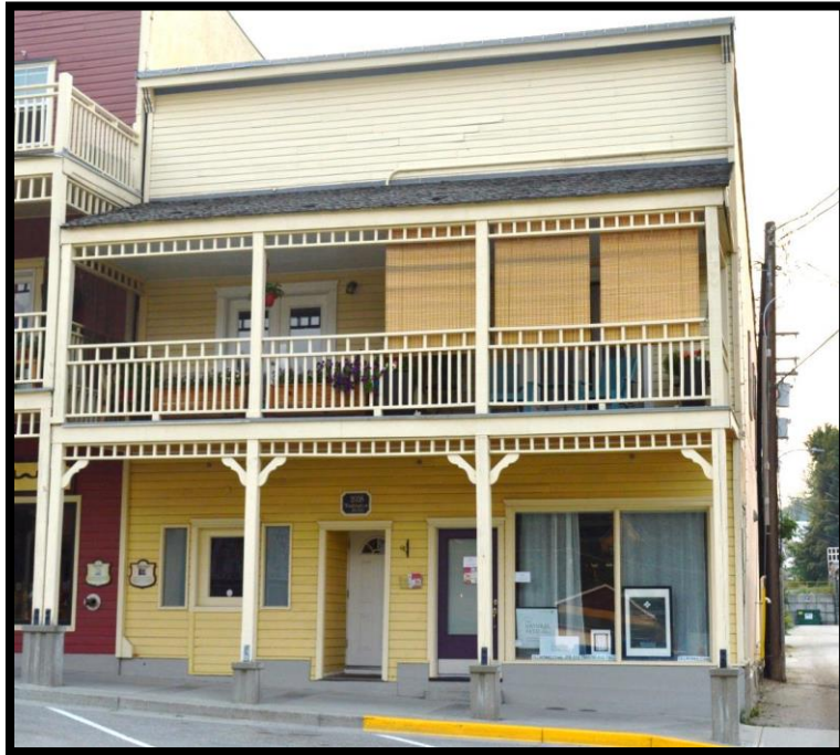
Collins Hotel – 2021