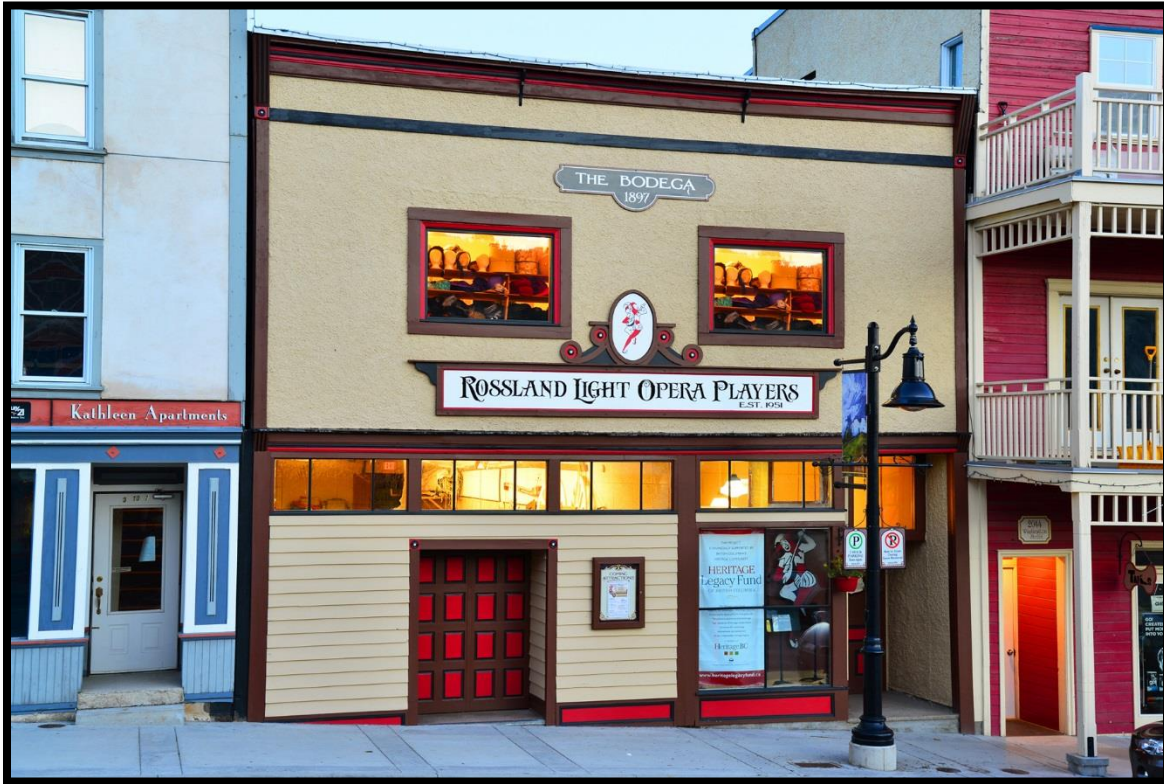
Bodega Hotel 2013